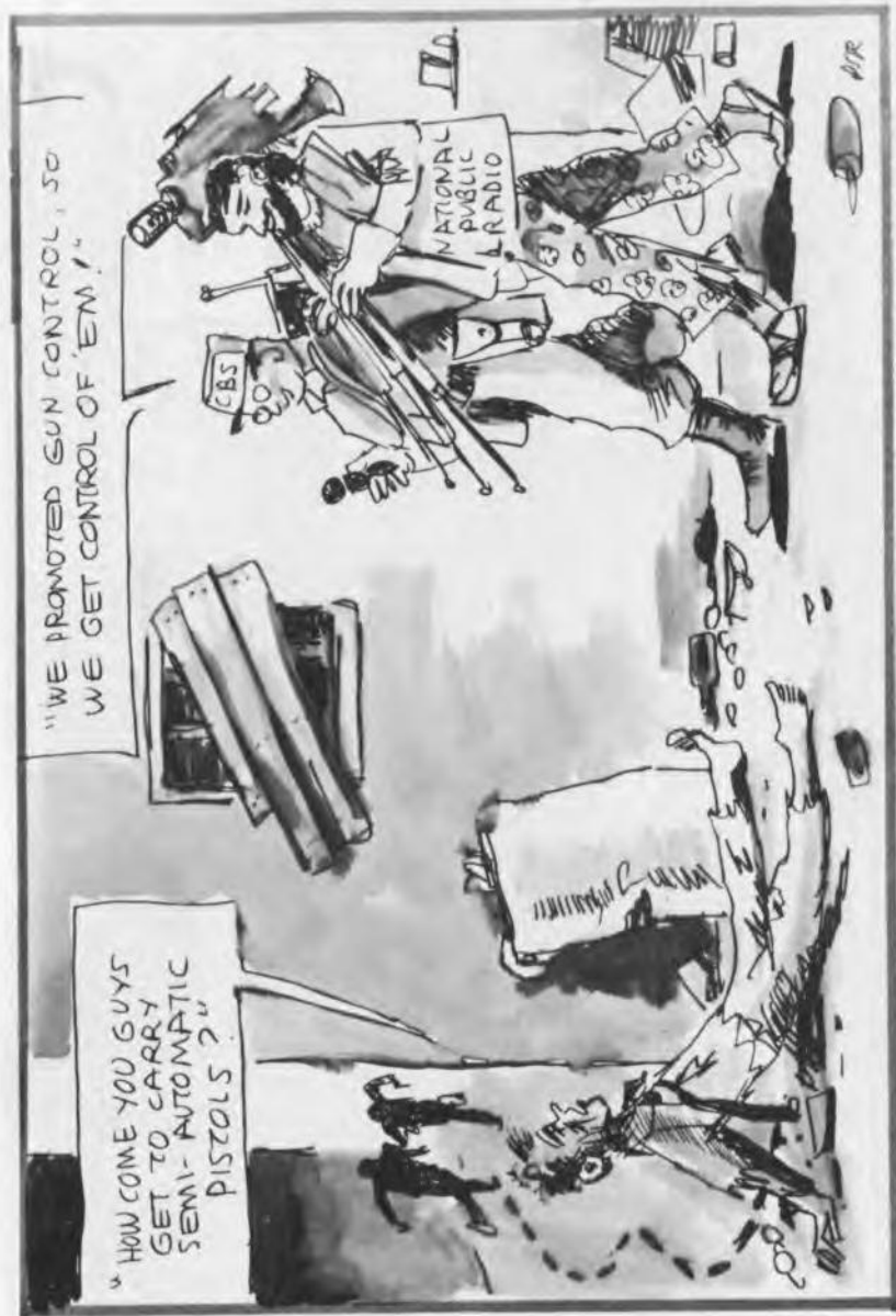
NEW YORK 1991: POLICEMEN, JOURNALISTS, AND REPORTERS CAN CARRY PISTOLS